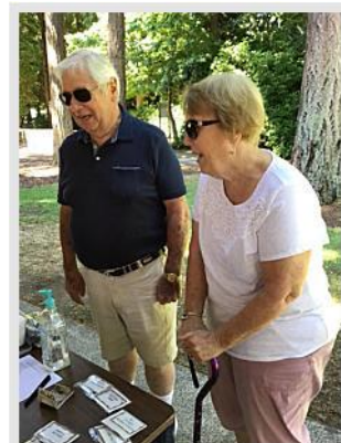
Edmonds City Park - Aug 4, 2021 - EHS'57 Reunion