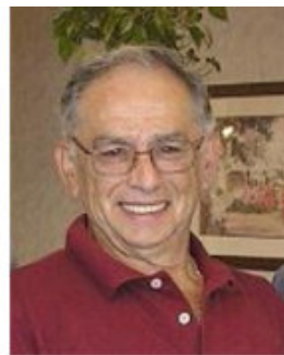
EHS lunch, 2009