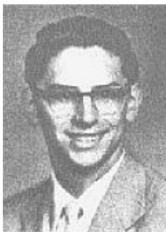
Senior Picture 1958