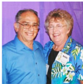
EHS Reunion, 2008