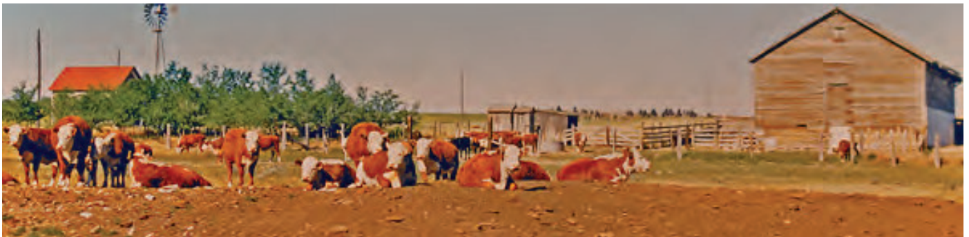
McAnulty Ranch, 1961.